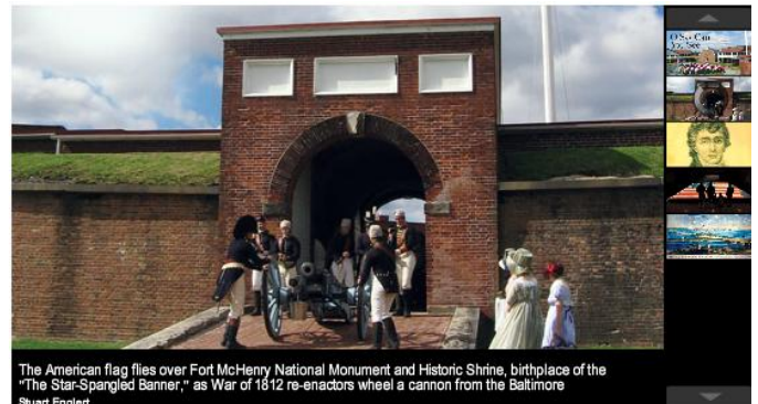
The American flag flies over Fort McHenry National Monument and Historic Shrine, birthplace of the “The Star-Spangled Banner,” as War of 1812 re-enactors wheel a cannon from the Baltimore