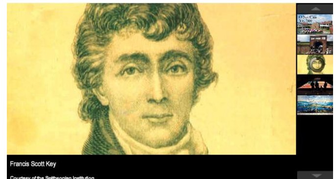
Francis Scott Key